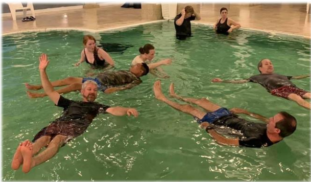
Float in the inside pool with water from the Dead Sea

The afternoon is free leisure times at the Resort and Spa, float in the Dead Sea or maybe shop for souvenirs at the nearby Dead Sea Mall.