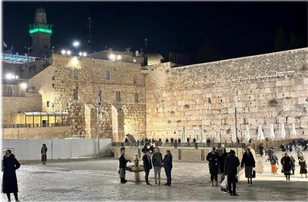
Western Wall Plaza

Your evening will be free to explore the old city.