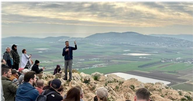
Jezreel Valley (Valley of Armageddon) in background

You then take a look from Mt Precipice in Nazareth where Luke describes how Jesus was rejected by those in the synagogue after He taught them. (Luke 4:29).