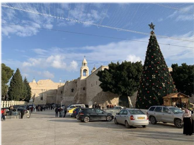
Manager Square in Bethlehem

From here you will see the Fields of Boaz where Ruth gleaned fields and near Bethlehem . You will then spend some time surveying the Shepherds' Fields just outside the town.