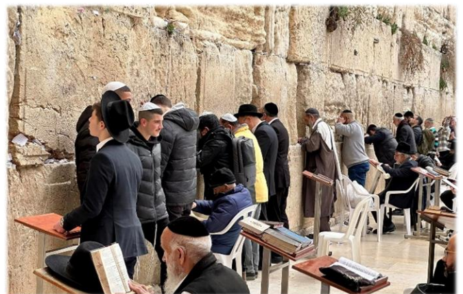
Orthodox Jews at the Western Wall

You will walk to the plaza and see the famous Western Wall . The open-air portion of the Western Wall where many gather to pray is actually only a small part of the entire wall. From within the tunnel, you can see much of the well-preserved Temple wall including two stone blocks weighing 600 tons each!