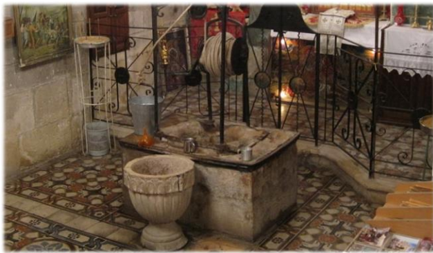
Jacobs Well in Nablus

You will drive by Mt Gerizim as you visit Shechem , the place Abraham first entered the Promised Land and erected an altar. You will see and drink out of Jacob's Well , the place where Jesus talked with the Samaritan woman. You will see where Joseph's bones were buried at the Tomb of Joseph. (Joshua 24:32).