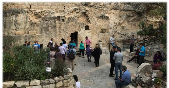
The Garden Tomb

The tour of Jerusalem continues with a visit to the Garden Tomb , from where you will view what some believe to be the place Jesus was crucified. The word Golgotha means "Place of a Skull". This hill stands just outside the walls at the intersection of two ancient roads.