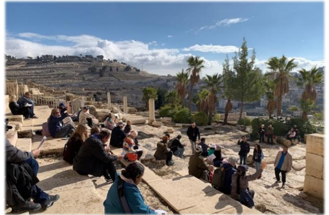
Southern steps and Mt of Olives in the background

Upon returning to Jerusalem, you will visit the Davidson's Visitor Centre at the Southern Wall excavations . You can visualize where Jesus and His disciples walked and where Peter preached on the day of Pentecost in Acts, chapter 2 as you stand upon the Southern Steps .