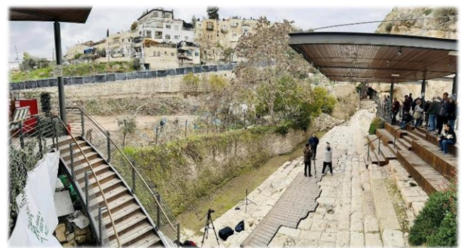
The recently discovered Pool of Siloam

Journey on foot to the bottom of the ancient City of David and visit the Pool of Siloam where Jesus sent the man who was born blind to wash his eyes to be healed. (John 9:1-11). You may even choose to walk through King Hezekiah's tunnel to get there!