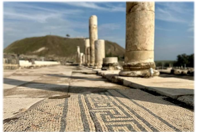
The Cardo at Beit Shean

You will then continue along the Jordan Valley and will make a stop at the city of Beit Shean located at the intersection of the Jezreel Valley and the Jordan River . There you will see an ancient Roman city that the Bible mentions in reference to Saul and his son Jonathan whose bodies were hanged on the city wall. (1 Samuel 31:8-13). The city contains many well-preserved ruins from different eras and empires including the Egyptians, Byzantines, Greeks, and Romans.