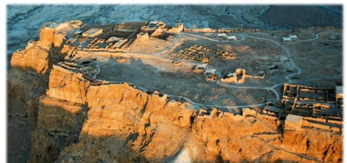
Ariel view of Masada

Ride in the cable car up to the top of Masada overlooking the Dead Sea . This was the location of one of King Herod the Great's palaces. It is a spectacular hilltop fortress. Here your guide will treat you to the history of the famous zealot stand. Ruins of the walls and massive Roman siege ramp are still visible today.