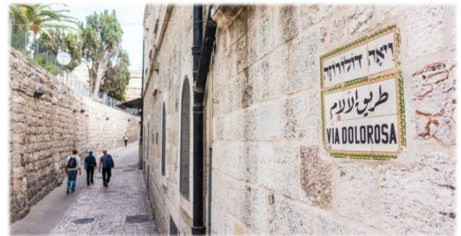
The traditional path of the Via Dolorosa

Then take a walk along the Via Dolorosa (the way of suffering) and then onto Antonia Fortress (Ecce Homo) where Jesus was brought before Pontius Pilate. (Luke 23:1 -11). You will visit the Church of the Holy Sepulchre the traditional site of the crucifixion and resurrection of Jesus.