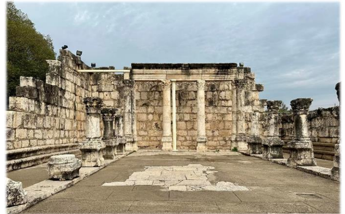
The ancient Capernaum synagogue

Explore Capernaum , the centre of Jesus' ministry, before going to the synagogue which stands on the site where Jesus taught. Recall His teaching and preaching the gospel of the kingdom. (Matthew 4:13, 23).