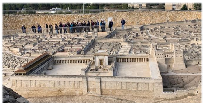
Second Temple model in Jesus' time

Enjoy time at the Israel Museum with the Shrine of the Book and view several priceless artifacts including the famous Dead Sea Scrolls. Adjacent to the museum is the open-air miniature model of Jerusalem that depicts the city of Jerusalem as it would have looked circa 70 A.D.