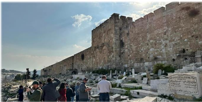
View of Eastern Gate from outside of Temple Mount

You begin the day with a visit to the Temple Mount , where the Jewish temple stood until its destruction by the Roman Legions in 70 A.D. There you will see the Dome of the Rock built over the rock where Abraham prepared to sacrifice Isaac. This was also the site of Ornan's threshing floor, purchased by King David. (1 Chronicles 21:18-26). Due to the volatile relationship between Jewish and Muslim world, the Dome of the Rock and Temple Mount area have been the source of much controversy over the years. From the Temple Mount, view the Eastern Gate that faces the Mount of Olives. This is the gate where Jesus will make His triumphal entry into Jerusalem. (Ezekiel 43:1-2,4; 44:1-3).