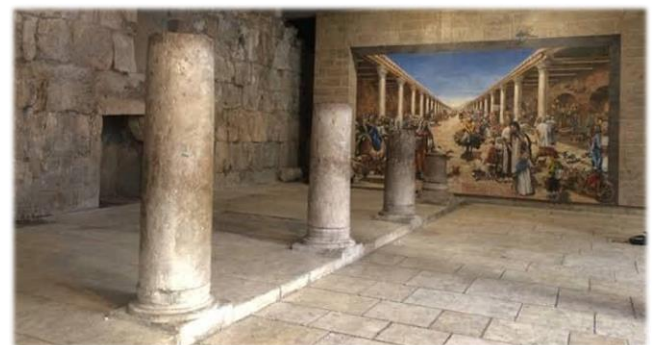
The Cardo with mural on the wall

Continue through the Jewish quarter of the old city and see the Cardo , an original Roman street and the amazing remains of the massive Broad Wall built by King Hezekiah .