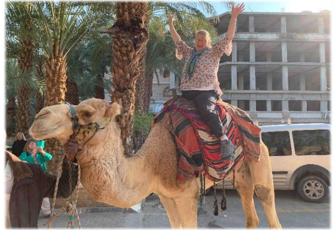
Enjoy a camel ride at Jericho

Then travel to Jericho , the oldest known walled city and the first place Joshua and the Israelites conquered upon entering the Promised Land.