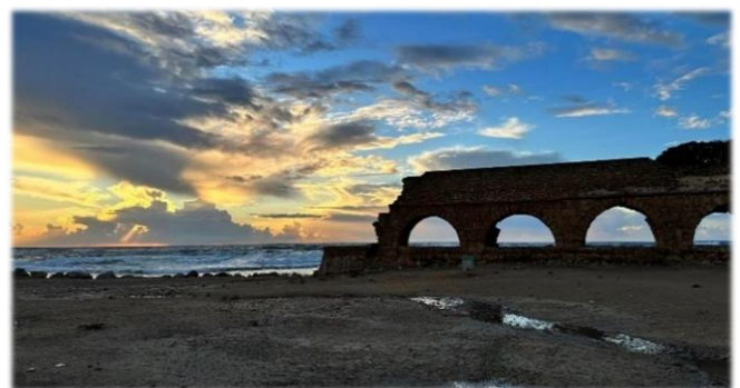
Herodian Aqueduct at Caesarea Maritima

Then a short drive to Caesarea Maritima . This maritime city was built by King Herod, and was once the seat of the Roman rule. Here, Cornelius became the first gentile to convert to Christianity. This is also the location where Paul was imprisoned before his trial in Rome. View the ruins of Herod's seaside palace and a large hippodrome where chariot races were conducted.