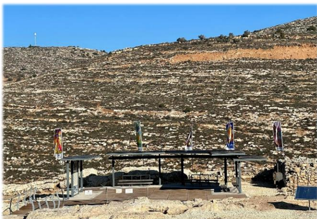
Ancient tabernacle site at Shiloh

Then it's on to ancient Bethel , the place Jacob saw a ladder to heaven. It was this sacred place that God made a land covenant to Jacob (Gen. 28:13-14). It was here where the tabernacle resided as well, and where Jeroboam erected an altar and golden calf, as he did in Dan (1 Kings 12:28-31). On your journey back to Jerusalem, you will drive by the site of ancient Ai , the second city Joshua and the Israelites destroyed.