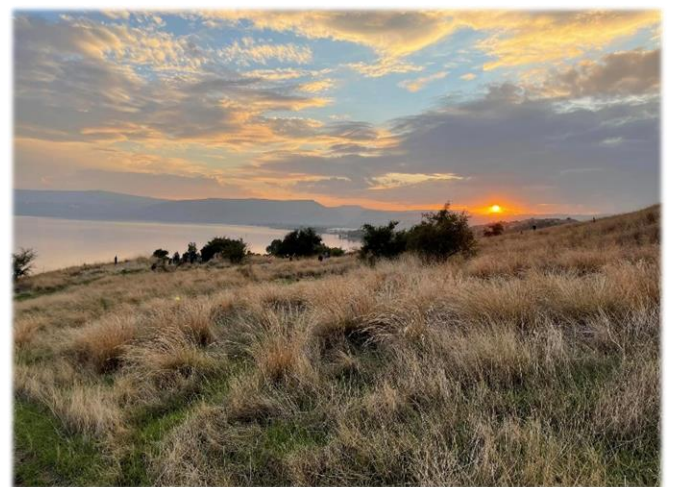
View from the Mt of Beatitudes

Ascend the peaceful Mount of Beatitudes which overlooks the Sea of Galilee and see the traditional site where Jesus preached His most famous sermon: the Sermon on the Mount. You will also view the traditional site of Job's Cave .