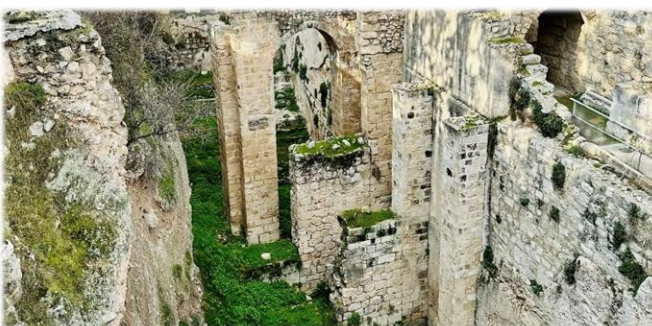
Ruins of the middle porch of the Pool of Bethesda

You will walk through St. Stephen's Gate , now known as the Lions Gate . It is the only gate in the eastern wall of the Old City of Jerusalem. In the Christian tradition, it is thought that the stoning of St. Stephen (Acts 7) occurred outside of this gate. View the Pool of Bethesda , (John 5:1-31), where Jesus performed the Sabbath miracle healing the lame man at this pool. St. Anne's Church , with incredible acoustics, is perfectly preserved and dates back to the time of the Crusades.