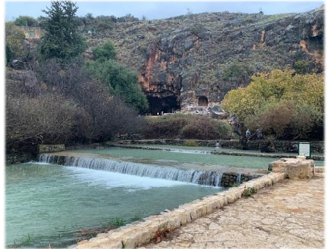
The Gates of Hell in the hill at Caesarea Philippi

Visit Caesarea Philippi , (Banias) where Jesus travelled with His disciples and where, nearby, Peter made his great confession to Jesus, "Thou art the Christ, the Son of the living God." (Matthew 16:16). Here, inside a grotto, the Greeks built a shrine to the god, Pan.